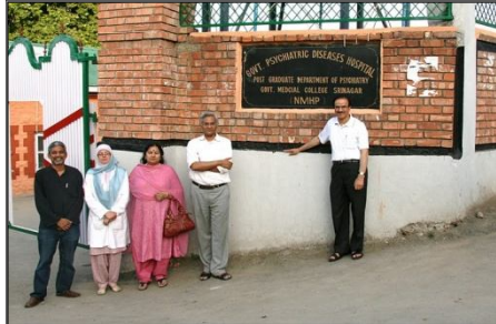
Visiting officials at the Psychiatric Diseases Hospital, Srinagar

facility for males and females is also available in the hospital. There has been substantial progress with respect to the infrastructure, services and initiation of courses. A few photographs depicting the progress are given below.