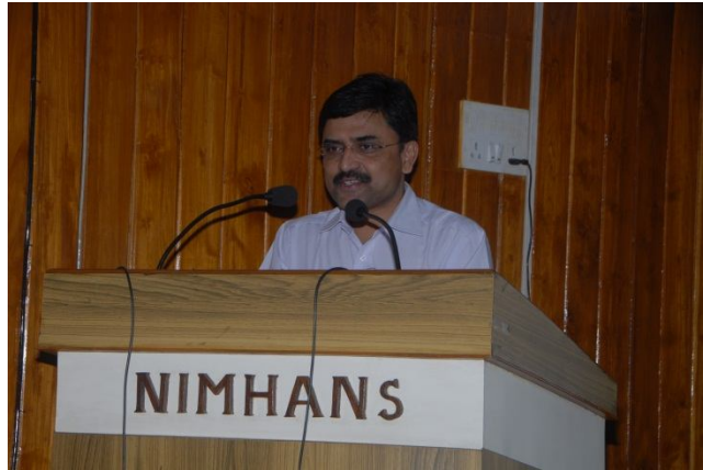
Principal Secretary (Health) of Andhra Pradesh presenting the status of National Mental Health Programme in the state

Andhra Pradesh – The discussion was started by Andhra Pradesh, the Principal Health Secretary made a brief presentation on state status and progress on mental health. He emphasized that the state government has been interested in up-grading mental health care facilities. It was mentioned that Government of Andhra Pradesh is taking adequate measures