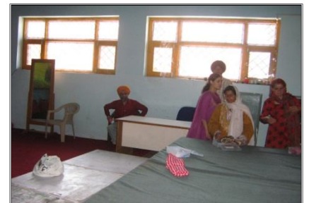
Indoor recreational activities