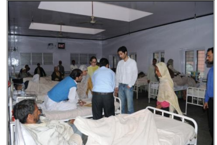
Doctors in the in-patient facility of the hospital