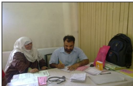
A patient being seen by a psychiatrist in the OPD.