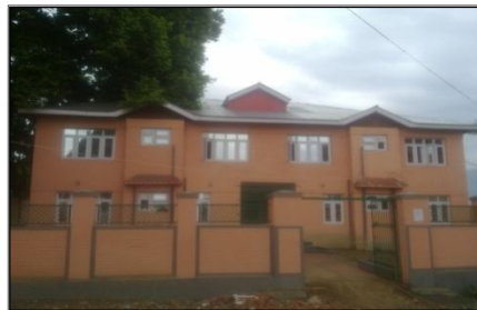
Newly constructed residential facility for trainees