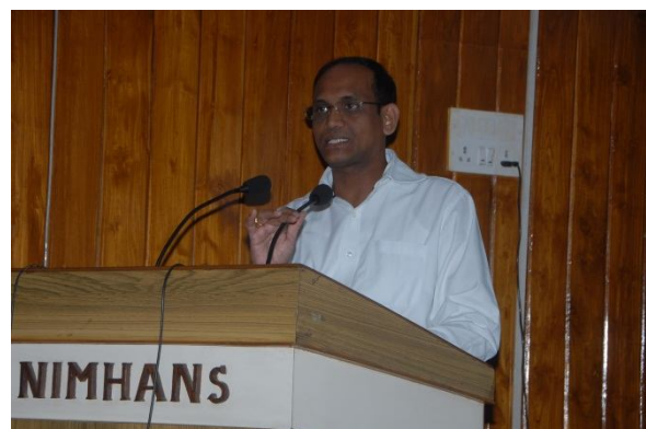
Principal Secretary (Health) of Karnataka presenting the status of National Mental Health Programme in the state.

He acknowledged that man-power shortage of mental health professionals is an issue in Karnataka and perhaps everywhere. He acknowledged the fact that despite having NIMHANS in State, posts of mental health professionals are still vacant. He mentioned that all the 30 districts of Karnataka have posts of Psychiatrist, Clinical Psychologist and Psychiatric Social Worker. Psychiatrists are available in 28 districts. However, Bijapur and Bhagalkot districts do not have either trained medical officer or psychiatrist. Man power of other mental health professionals is barely available in