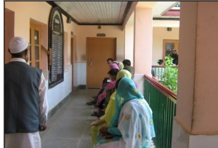
Patients waiting area