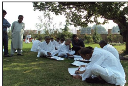
Outdoor recreational activities