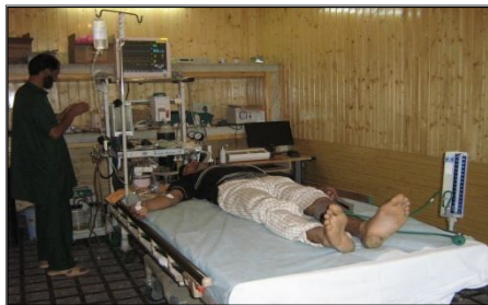
Modified ECT unit