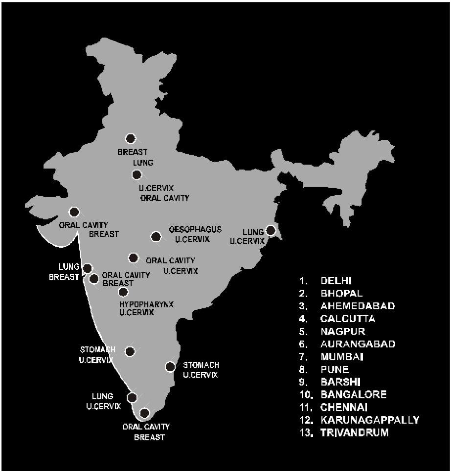
Fig.1 Leading cancer sites in Population Based Registries in India 1995-96

Tobacco consumption either as chewing tobacco or smoking tobacco will account for 50% of all cancers in men. Dietary practices, reproductive and sexual practices etc will account for 20-30% of cancers. Appropriate changes in lifestyle can reduce the mortality and morbidity from a good proportion of Cancer, Diabetes Mellitus and Cardiovascular diseases.