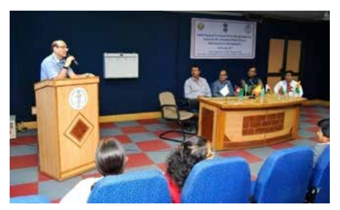
Valedictory Function of the SAARC Regional Training