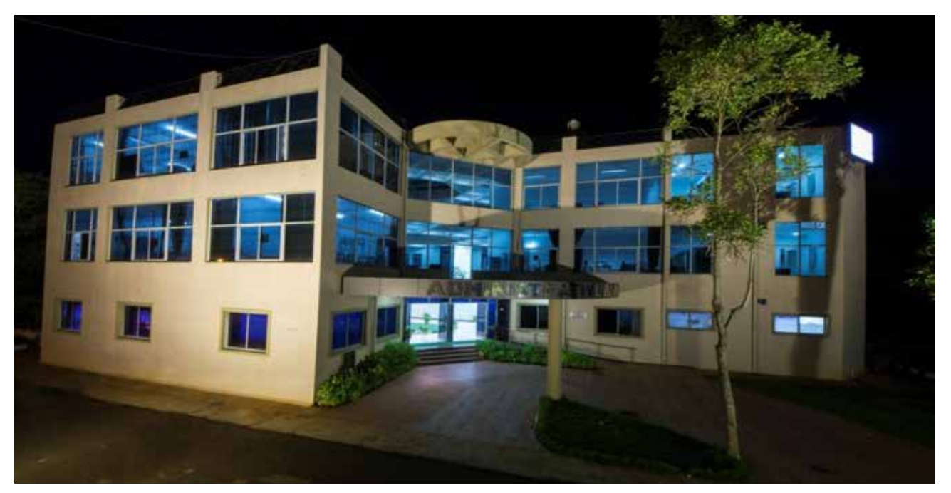
All India Institute of Speech and Hearing, Mysuru, Karnataka

The major activities carried out by the Institute from 1<sup>st</sup> April to 30<sup>th</sup> September, 2017 are given below: