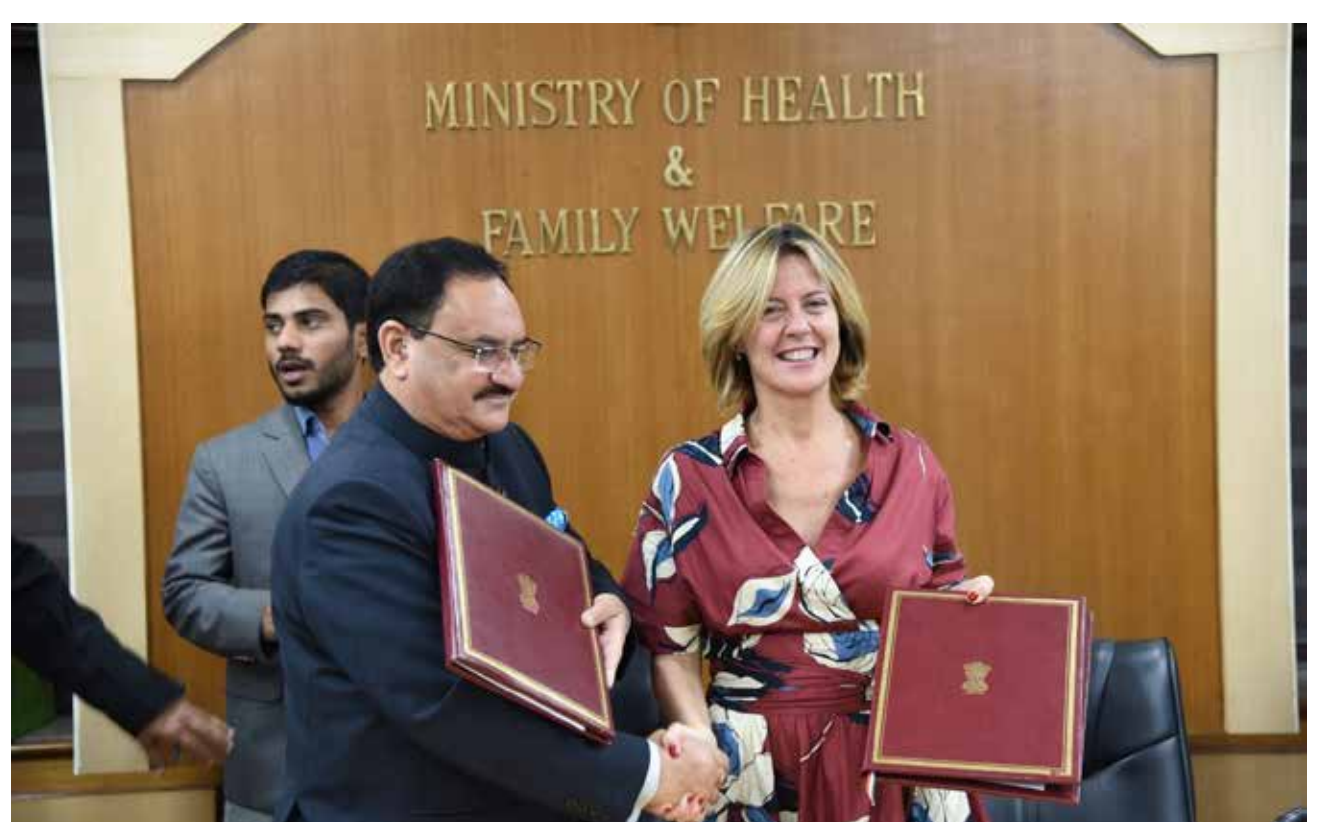
Meeting of Hon'ble Union Minister for Health & Family Welfare Shri J.P. Nadda with H.E. Health Minister of Italy, Ms. Beatrice Lotenzin on 29<sup>th</sup> November, 2017