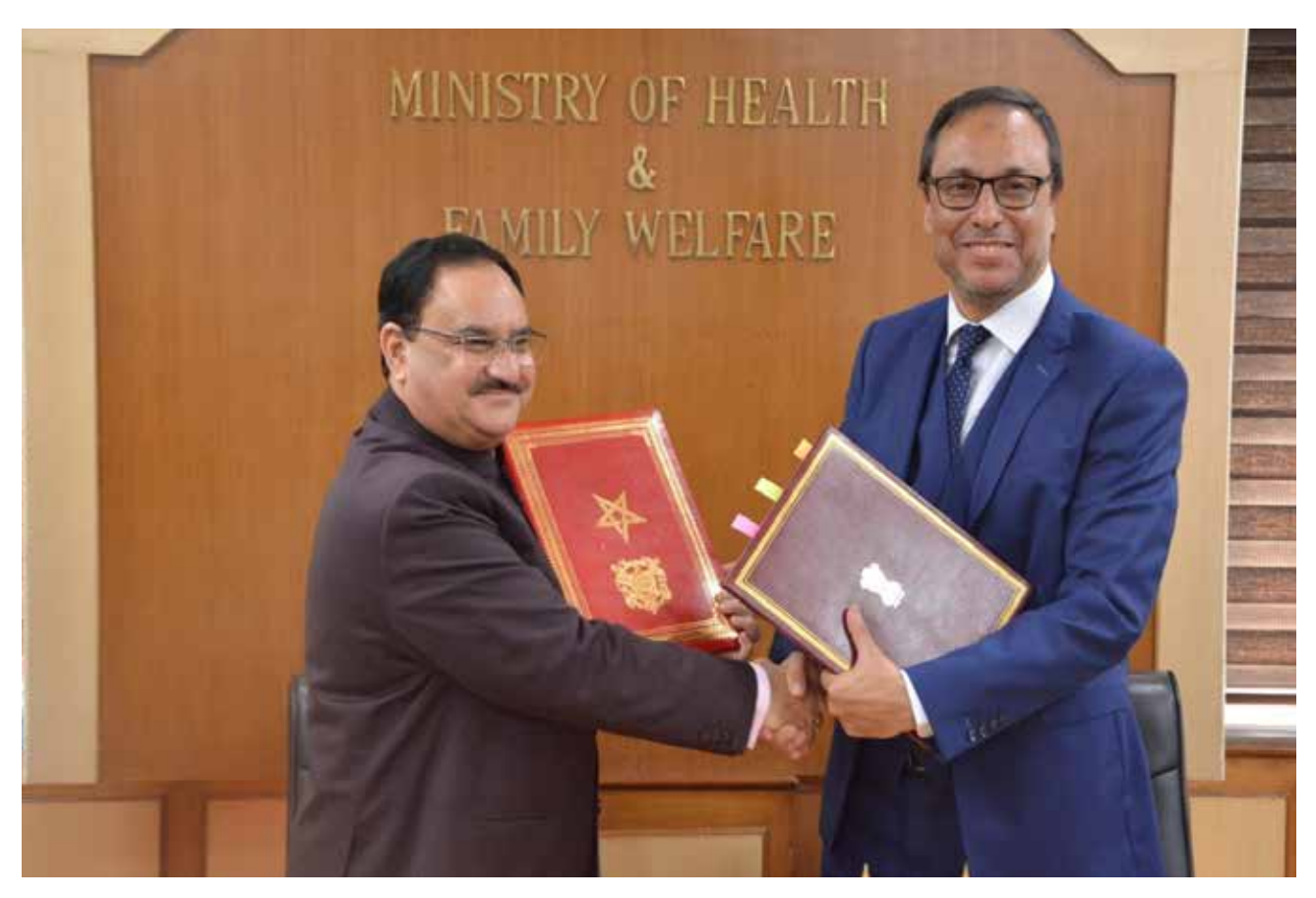
Meeting of Hon'ble Union Minister for Health & Family Welfare Shri J.P. Nadda with H.E. Health Minister of Morocco on 14<sup>th</sup> December, 2017 and signing of MoU on Health Cooperation and Telemedicine