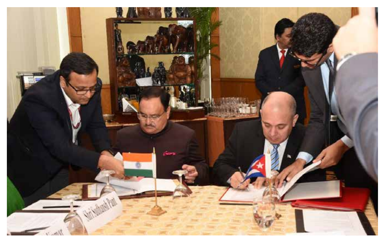
Meeting of Hon'ble Union Minister for Health & Family Welfare Shri J.P. Nadda with H.E. Health Minister of Cuba, Dr. Roberto Morales Ojeda on 6<sup>th</sup> December, 2017

(29) A Meeting with H.E. Minister of Health of Italy Ms. Beatrice LOTENZIN on 29.11.2017 at New Delhi and an MoU signed on Health cooperation