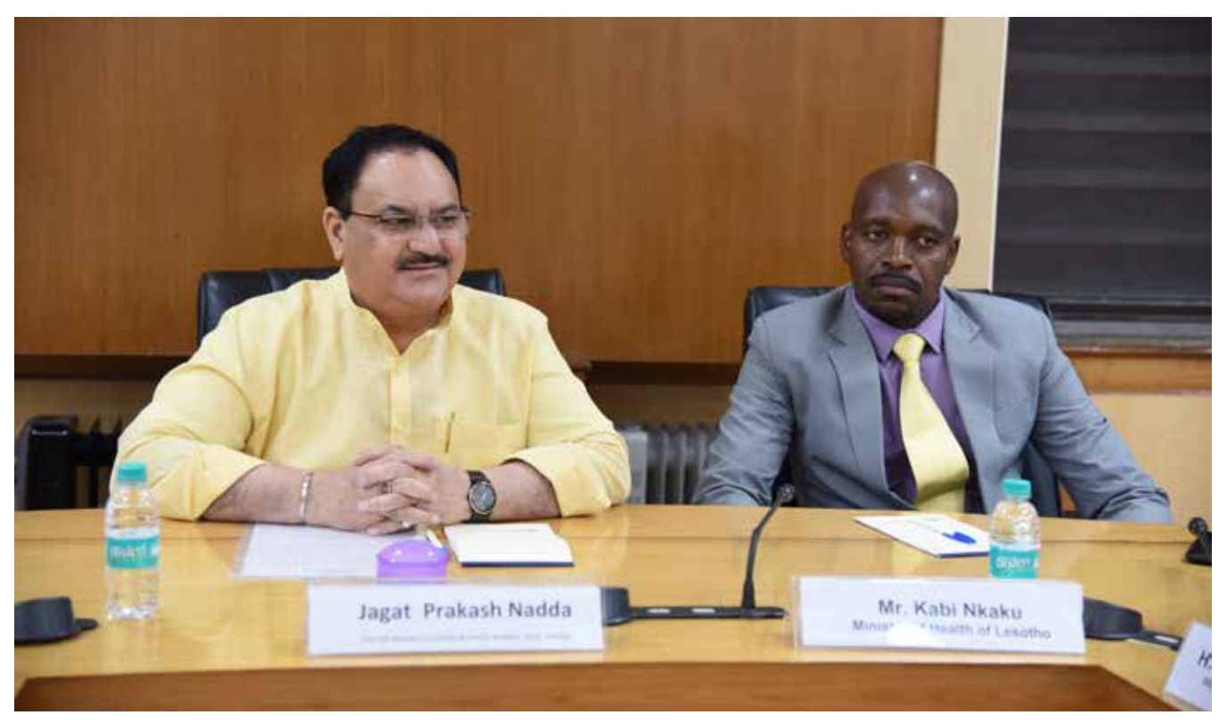
Meeting of Hon'ble Union Health Minister with Hon'ble Health Minister of Lesotho