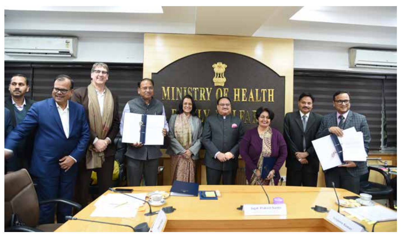
Signing of MoU Secretary-HFW, RD-WHO (SEARO) & MD-NBCC

Welfare, Government of India and providing technical support. Activities under WHO are funded through two sources :- The Country Budget which comes out of contributions made by member countries and Extra Budgetary Resources which come from (a) donations from various sources for general or specific aspects of health; (b) funds routed through the WHO to countries by other member countries or institutes / agencies. India is the largest beneficiary of the country budget within the South East Asia Region. The budget is operated on a biennium basis, calendar year wise.