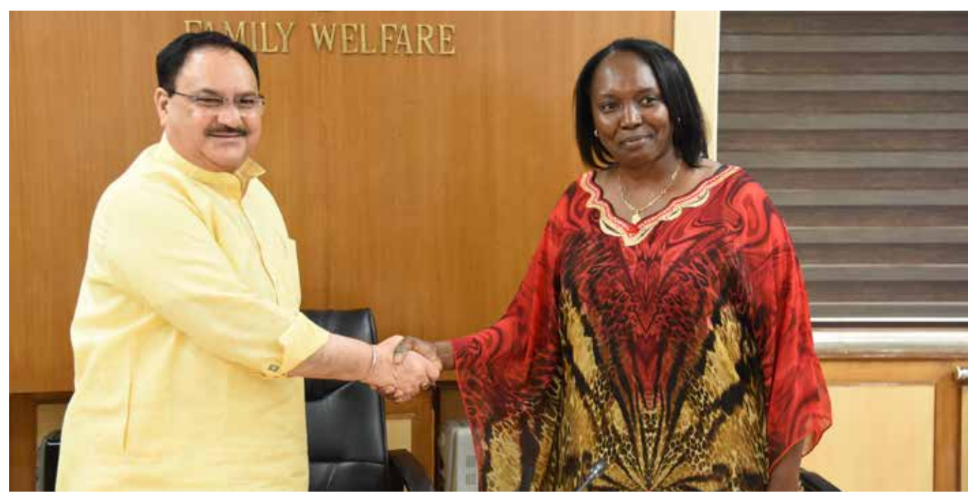
Meeting of Hon'ble Union Health Minister with Hon'ble Health Minister of Angola